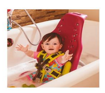
Adjustable Bumper Supports

Splashy's base unit lets you switch easily between 26 recline positions, from upright [106 degrees] to full recline [140 degrees].