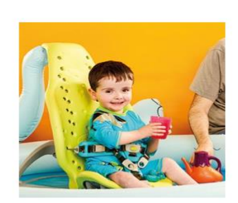
Lightweight and Portable

It's a portable, lightweight and supportive seat that works for bathing or messy play wherever you go.