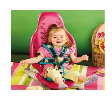
3 or 5- point harness

It's a portable, lightweight and supportive seat that works for bathing or messy play wherever you go.