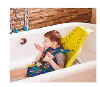
26 Recline Options

Splashy adapts to the child's postural support needs, with the option of a 5-point harness or a 3-point pelvic support.