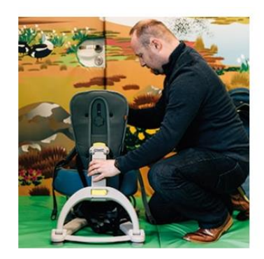
26 Recline Options

Floorsitter accessory has 26 recline positions, from upright [106°] to full recline [140°].